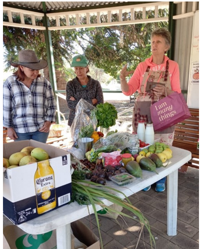
Garden Swap produce on display