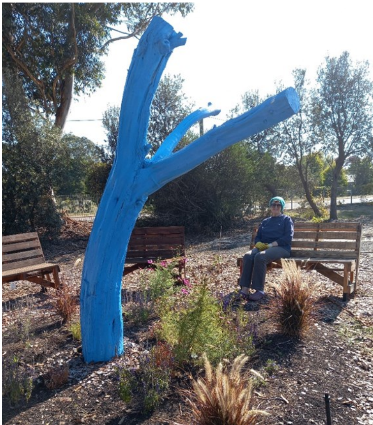
Sheryl seated in the Reflection Garden